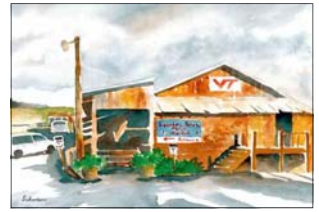
Saunders Farm Market by Ashley Scholer