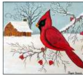
Joyce T. Green

Pack of 8 (1 of ea. Design) Includes 2 Bonus Cards