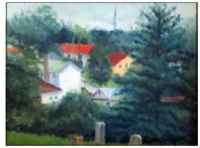
View from City Cemetery by Seymour Woodnick