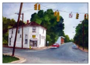
Triangle Diner by Smokie Watts