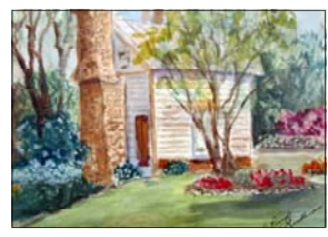
Restored Cabin on Pearl Street by A. Pierre Guillermin