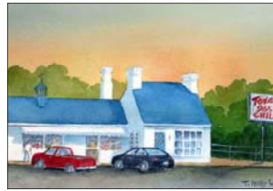
Texas Inn by Smokie Watts