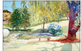
City Cemetery Pond by Purnell Pettyjohn