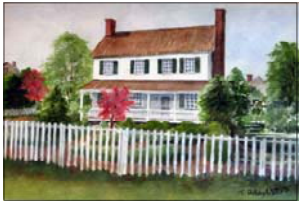
Miller Claytor House