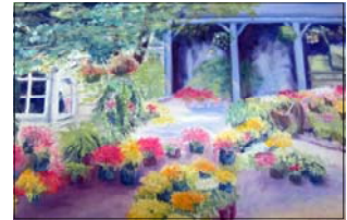
Autumn at the Farm Basket by Seymour Woodnick