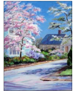
Washington Street