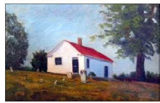
Pest House by Seymour Woodnick