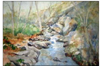
Matt's Creek along the Appalachian Trail