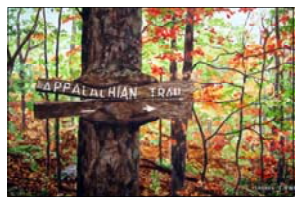
Appalachian Trail Sign by Laurel Ibbotson Foot