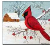
Joyce T. Green

Pack of 8 (1 of ea. Design) Includes 2 Bonus Cards