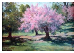
Riverside Park by Bertha Crockett