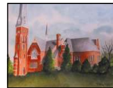
First Baptist Smokie Watts