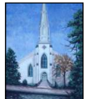
Holy Cross Al Pletke