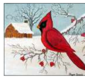
Joyce T. Green

Pack of 8 (1 of ea. Design) Includes 2 Bonus Cards