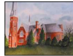
First Baptist Smokie Watts