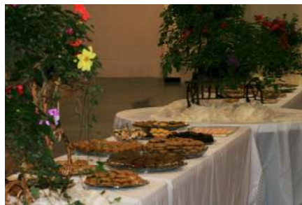
All good celebrations must have good food, and this was no exception thanks to Tiny's Catering