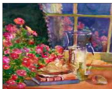
Purnell H. Pettyjohn

Floral Note Cards Pack of 8 Was $10.00—now only $8.00